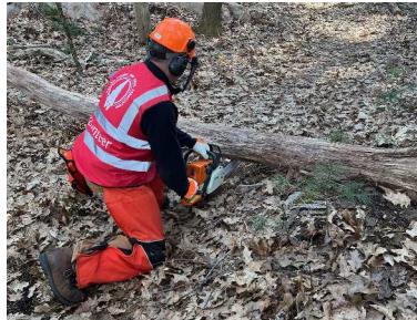
A Red Vest clearing a blockage