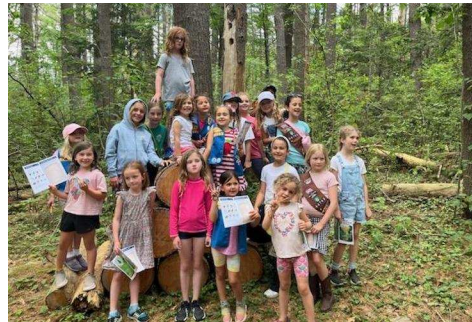
A Junior Ranger crew