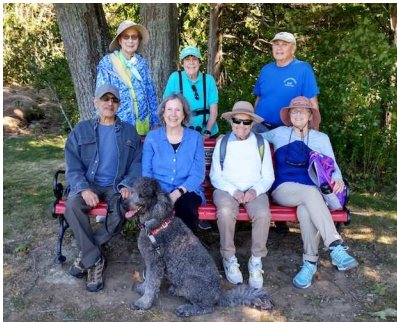
Fall COA walk at College Pond