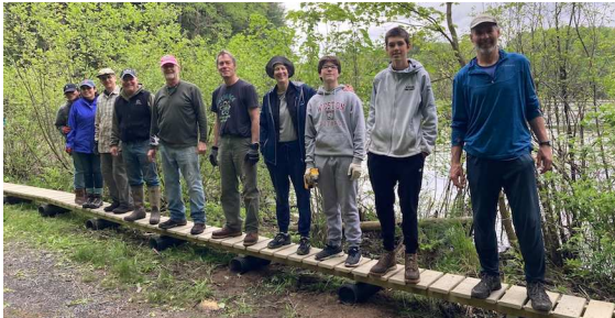
Volunteers on a completed bogwalk

Working with the Weston Conservation Department, WFTA has been hosting monthly Stewardship Saturdays. We build boardwalks, remove invasives, reroute trails, spread mulch and socialize. If you are interested in being on the email list, drop us a line at WestonForestTrail@gmail.com . WFTA also partners with local schools, colleges and the Boy Scouts to tackle trail improvement projects.