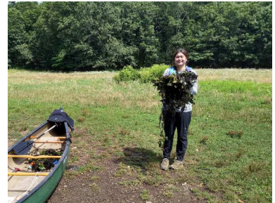
Our summer crew clearing invasives from Hobbs Pond